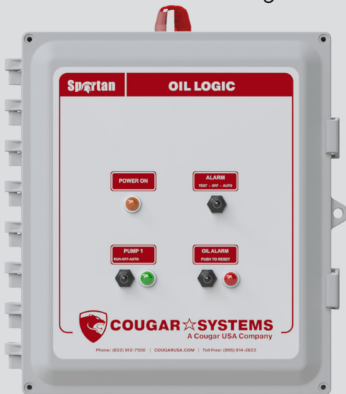
Oil Logic Series

The Spartan Oil Logic Series is an economical control panel specifically designed for oil/water interface sump pump applications, such as hydraulic elevator sumps, transformer vaults and any sump pump application where the presence of oil needs to be detected. The UL 508a Listed control panel utilizes a combination oil/water level sensor that allows pump operation in the presence of water and prevents pump operation in the presence of oil. In addition to typical motor controls, the system also provides both a high level alarm and oil present alarm with auxiliary alarm contacts for remote indication.