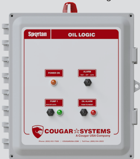
Oil Logic Series

The Spartan Oil Logic Series is an economical control panel specifically designed for oil/water interface sump pump applications, such as hydraulic elevator sumps, transformer vaults and any sump pump application where the presence of oil needs to be detected. The UL 508a Listed control panel utilizes a combination oil/water level sensor that allows pump operation in the presence of water and prevents pump operation in the presence of oil. In addition to typical motor controls, the system also provides both a high level alarm and oil present alarm with auxiliary alarm contacts for remote indication.